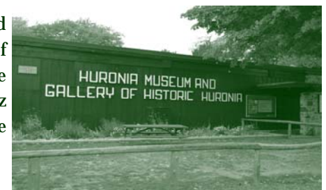
Huronia Museum 2008