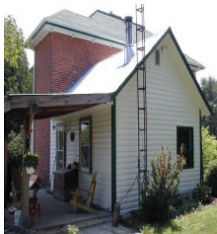
Fig 2: Addition on back of house