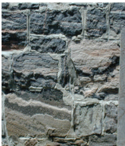
Fig 1: Field stone foundation

The house contains many of its original features. The brick structure of the house was built in 1915 by John Robinson. The addition on the rear of the house was added about 20 years later and used as a wood and mud room (Fig 2). The addition has since been converted into a rec room. The roof line of the house is a 4-sided mansford which consists of no peaks. The soffit is decorated with brackets that are a common feature within the area (Fig 3). The foundation like many farm houses is the original fieldstone (Fig 1). Inside the house, many features are original. The dining room consists of a oak ceiling with a decorative design. The living room ceiling is also unique, featuring a very detailed, decorative tin ceiling. The original section of the house all consists of wainscoting and the trap door for water still exists in the floor boards.