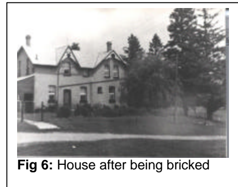
Fig 6: House after being bricked