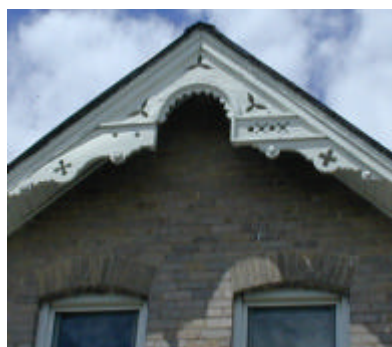
Fig 1: Decorative eaves

The barn and sheds were built about 1884 and are still original in features. Compared to the house, the barns are very plain as there was no decorative trim or features added and they were originally not painted. The barn was originally built on the ground without a stable beneath it (Fig 4). Once a stable was built underneath the barn, it was moved to its present location. The barn was originally a standard structure of about 40 x 60 with three bays; however, the barn was enlarged in about 1900 when it was moved to have a stable. Another two bays were added along with a second thresh floor. The barn originally had cedar shingles and has been changed to a steel roof over the years.