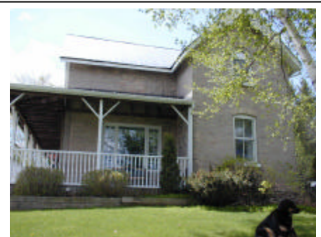
Fig 3: East part of house (original section)