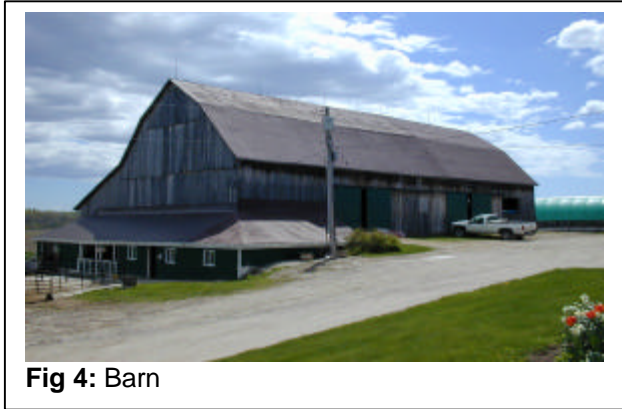
Fig 4: Barn