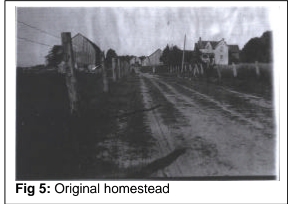
Fig 5: Original homestead