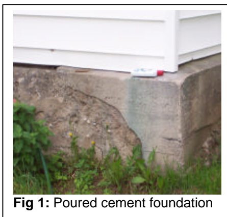
Fig 1: Poured cement foundation

The barn is original and is completely intact (Fig 3). The fieldstone foundation can be seen in Fig 4. Boards may have been replaced but most are originally there, the roof has been replaced and is steel. There is an opening for storage of equipment and the stables with a walk out as many barns in this area were built in that fashion.