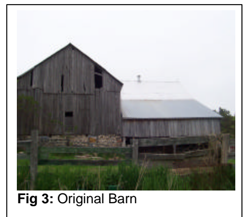
Fig 3: Original Barn