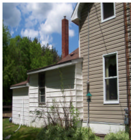
Fig 2: Addition