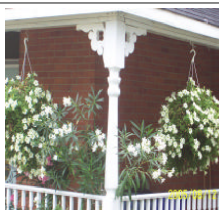
Fig 2: Decorative on porch