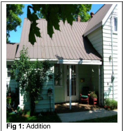
Fig 1: Addition

The house was originally built with wood as there was a large source in the area. However, the house was covered in insulbrick at one point and now has wood clapboard siding overtop. The front porch contains a decorative trim and the posts are original (Fig 3). There have been two additions put onto the house (Figs 1 & 2). It is unknown of the dates and cannot be told as everything is covered with the wood siding. The second addition appears to have been at one time a summer kitchen. It is much smaller and has its own chimney which could have been for the fire or oven. It is farthest away from the house which would keep the heat out of the central area of the house. This indicates that the additions were built at an earlier time as summer kitchens are not popular in today's buildings.