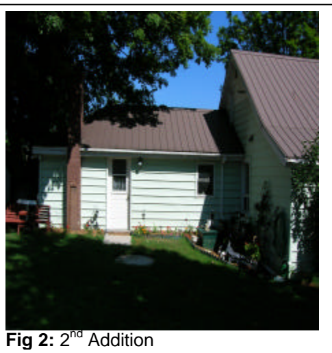
Fig 2: 2 nd Addition